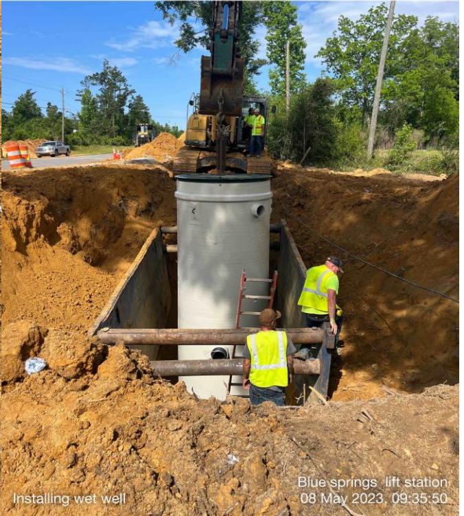
Installing wet well Blue springs lift station 08 May 2023, 09:35:50