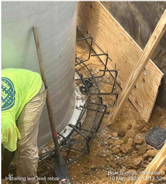
Installing wet well rebar Blue springs lift station 10 May 2023, 13:17:52

⊗ 300°NW (T) ● 30°46.991'N, 85°10.706'W ±16ft ▲ 109ft ⊗ 39°NE (T) ● 30°46.989'N, 85°10.713'W ±9ft ▲ 106ft