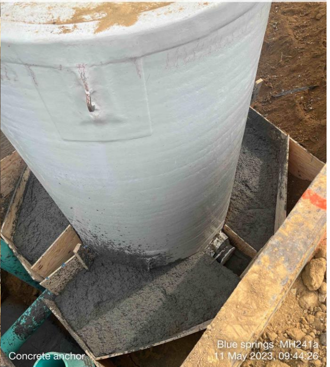
Concrete anchor Blue springs MH241a 11 May 2023, 09:44:26