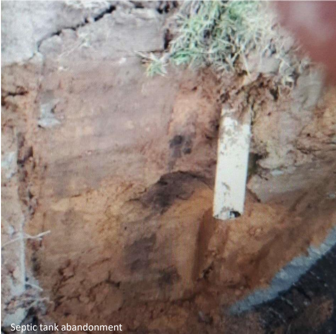
Septic tank abandonment

☉ 175°S (T) ● 30.767463, -85.171106 ±3 m ▲