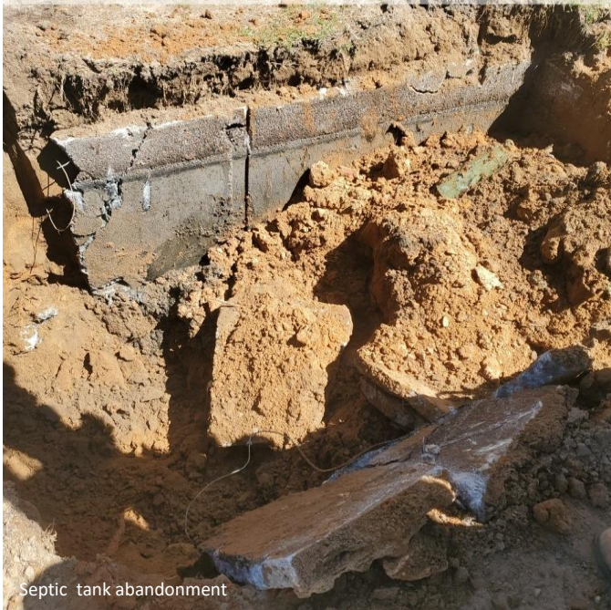
Septic tank abandonment

☉ 129°SE (T) ● 30.767797, -85.167766 ±7 m