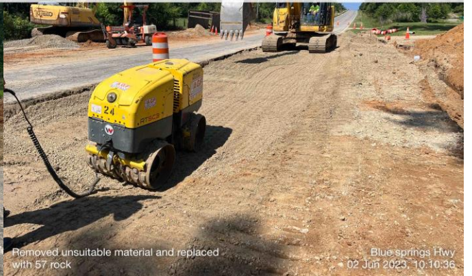
Removed unsuitable material and replaced with 57 rock

S 150 180 SW 210 240 W 270 NW 330 238°SW (T) 30°46.988'N, 85°10.712'W ±9ft ▲ 125ft