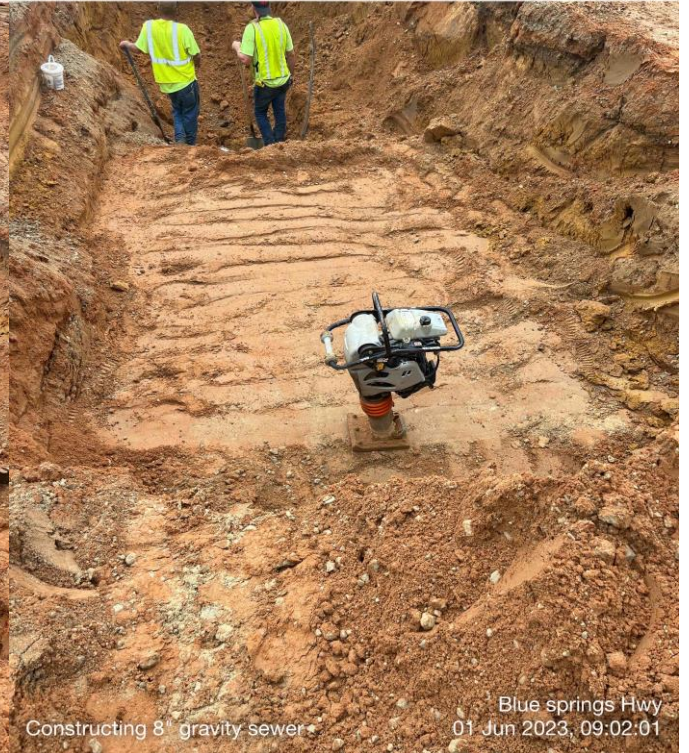
Constructing 8" gravity sewer