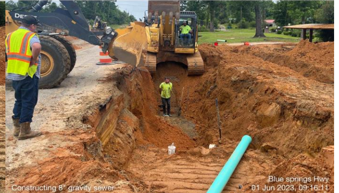
Constructing 8" gravity sewer

S 180 SW 210 240 W 270 NW 300 330 262°W (T) 30°46.981'N, 85°10.708'W ±13ft ▲ 109ft