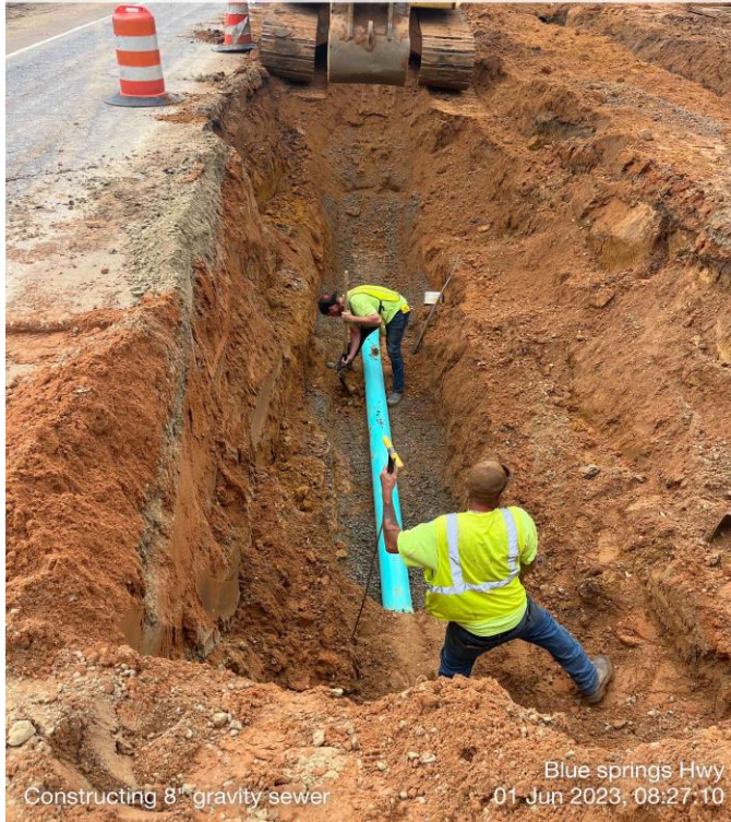
Constructing 8" gravity sewer

SW 210 240 W 270 NW 300 330 SW 210 240 W 270 NW 300 330 263°W (T) 30°46.982'N, 85°10.715'W ±16ft ▲ 115ft 277°W (T) 30°46.987'N, 85°10.710'W ±29ft ▲ 72ft