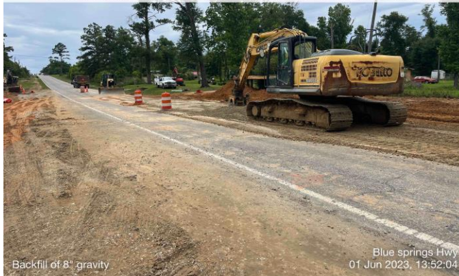
Backfill of 8" gravity

SW 210 240 W 270 NW 330 N 0 288°W (T) 30°46.981'N, 85°10.707'W ±42ft ▲ 123ft