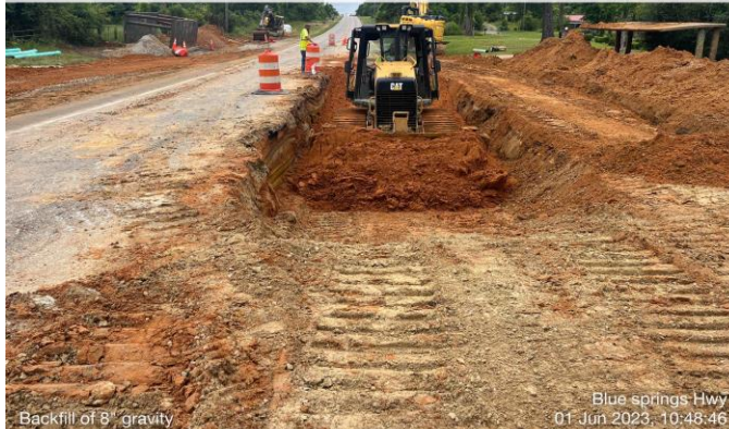
Backfill of 8" gravity

S 180 SW 210 240 W 270 NW 300 330 263°W (T) 30°46.982'N, 85°10.712'W ±13ft ▲ 122ft