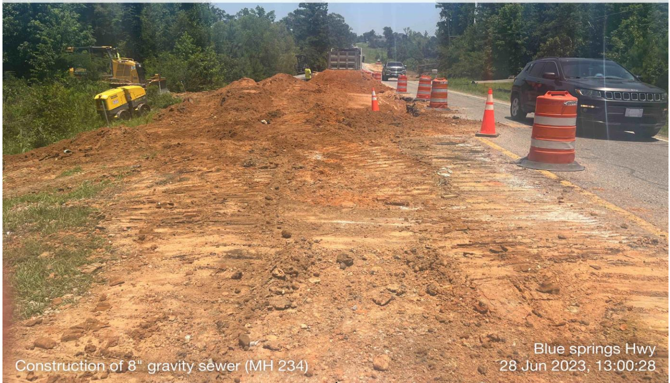
Construction of 8" gravity sewer (MH 234)

☀ 78°E (T) ● 30°46.957'N, 85°10.868'W ±9ft ▲ 162ft