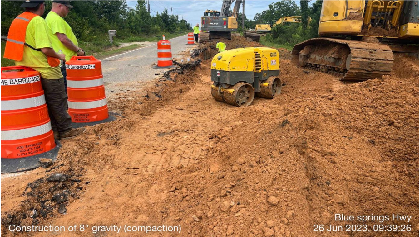
Construction of 8" gravity (compaction)

☀ 253°W (T) ● 30°46.965'N, 85°10.822'W ±13ft ▲ 149ft