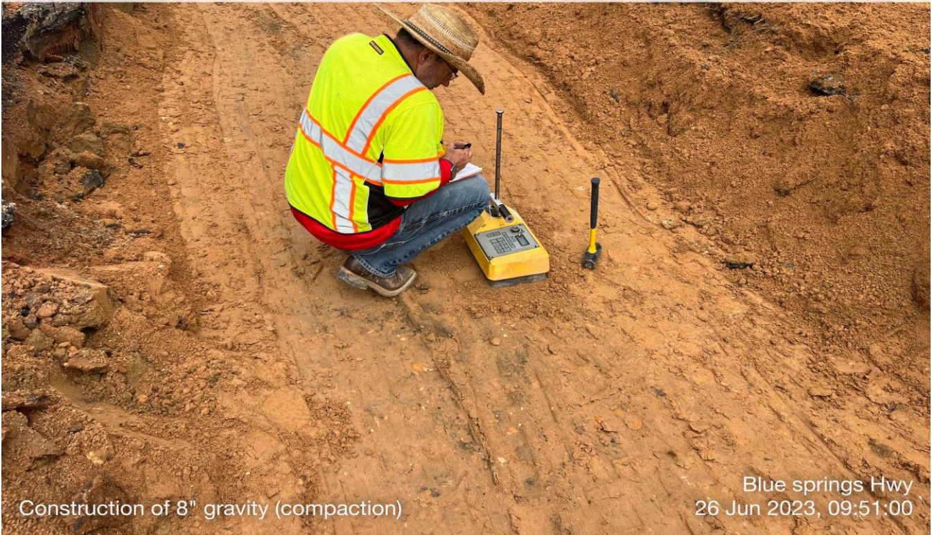
Construction of 8" gravity (compaction)

☀ 281°W (T) ● 30°47.008'N, 85°10.532'W ±4333ft ▲ 122ft