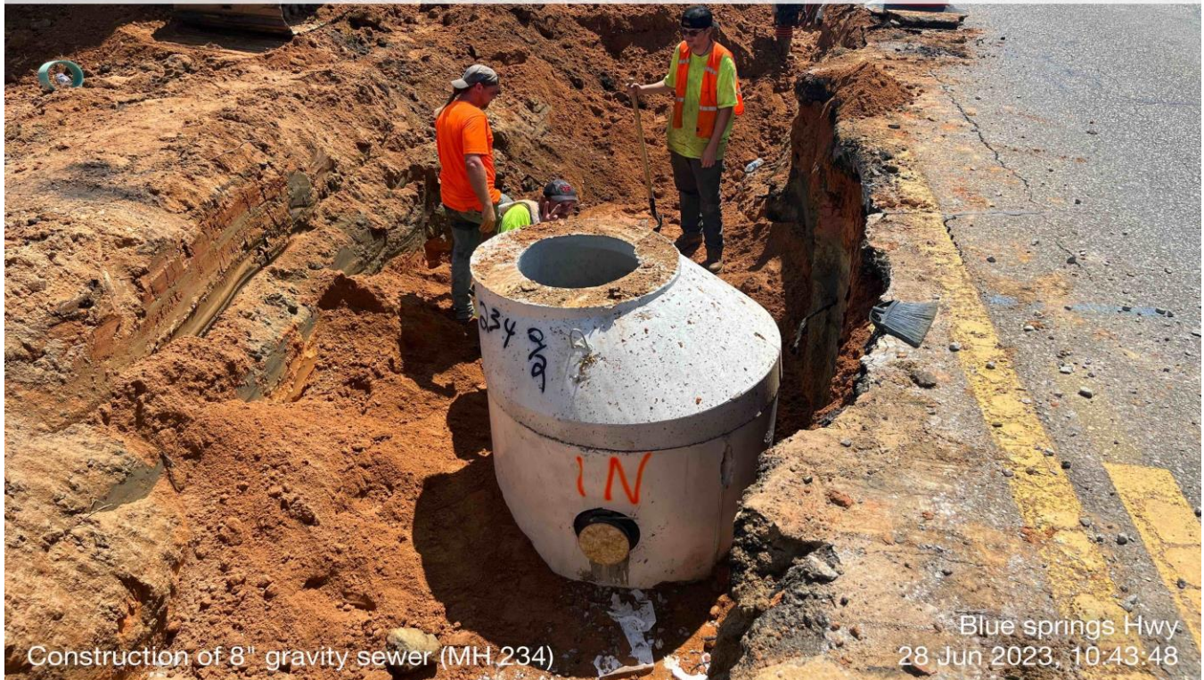
Construction of 8" gravity sewer (MH 234)

☀ 70°E (T) ● 30°46.957'N, 85°10.862'W ±13ft ▲ 147ft