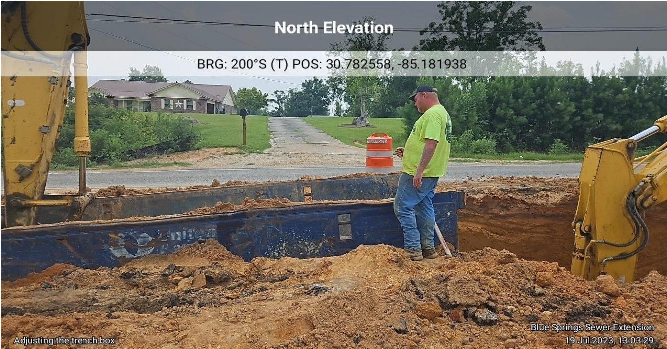
Adjusting the trench box

BRG: 200°S (T) POS: 30.782558, -85.181938