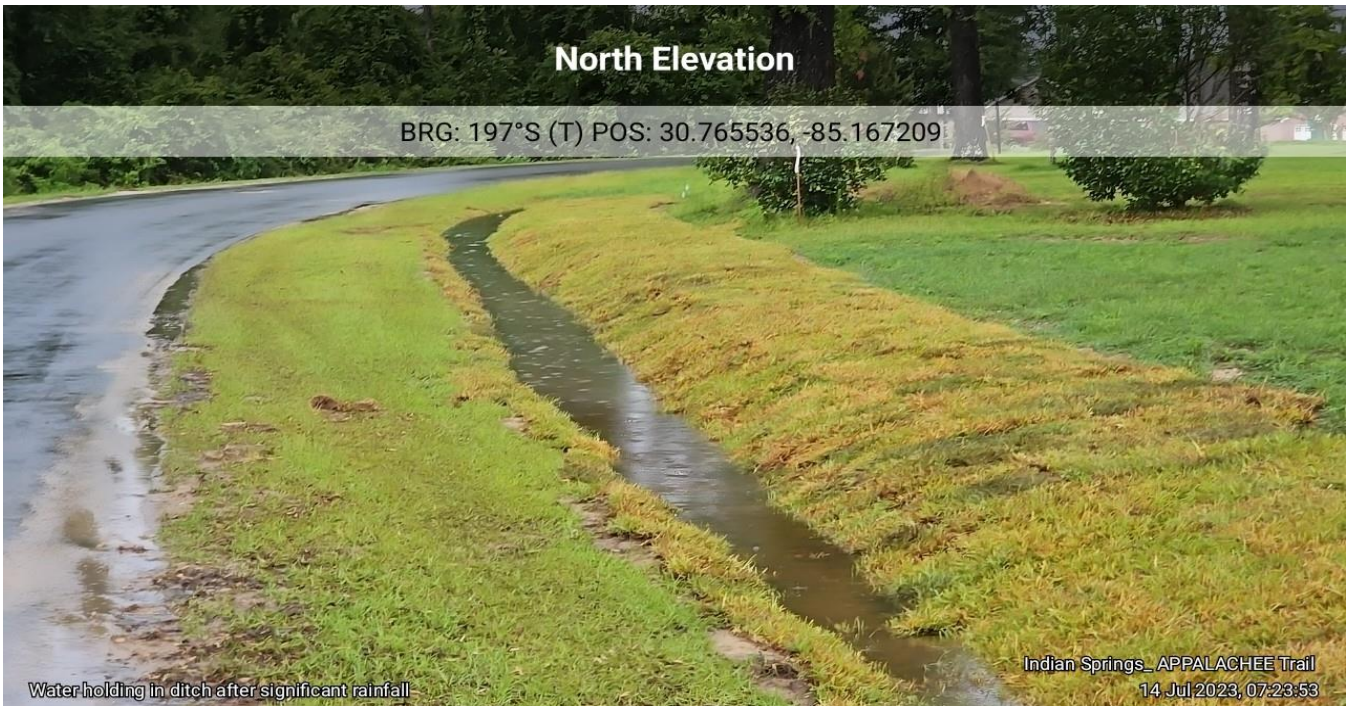
Water holding in ditch after significant rainfall

BRG: 197°S (T) POS: 30.765536, -85.167209