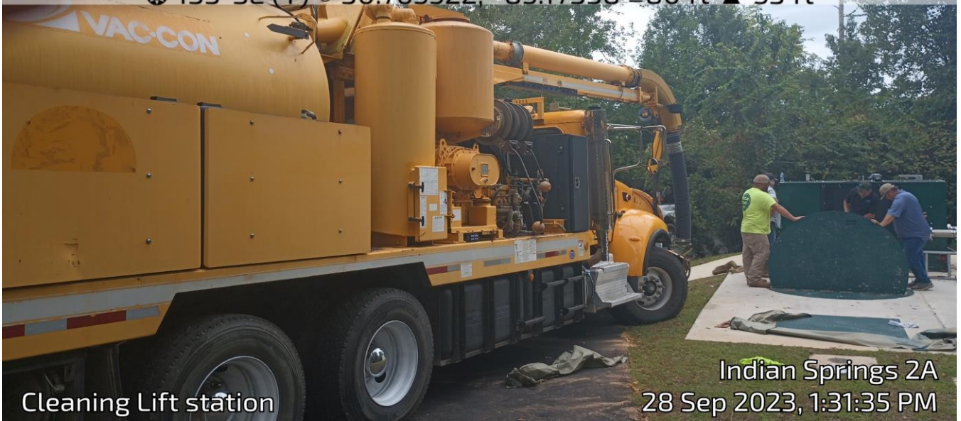
Cleaning Lift station

☉ 133°SE (T) ● 30.765522, -85.17338 ±80 ft ▲ 53 ft