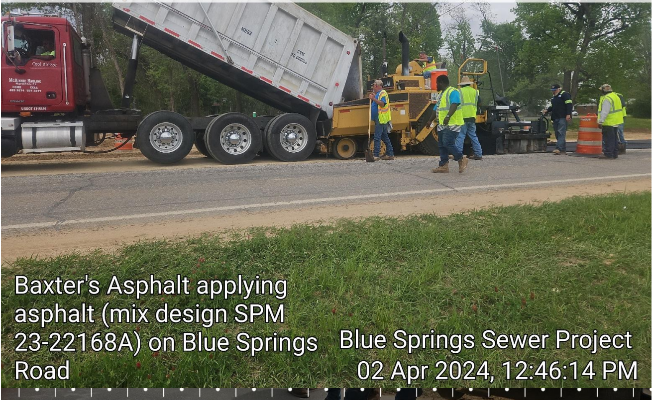
Baxter's Asphalt applying asphalt (mix design SPM 23-22168A) on Blue Springs Road Blue Springs Sewer Project 02 Apr 2024, 12:46:14 PM

106° E (T) • 30.781612, -85.186674 ±3 m ▲ 25m