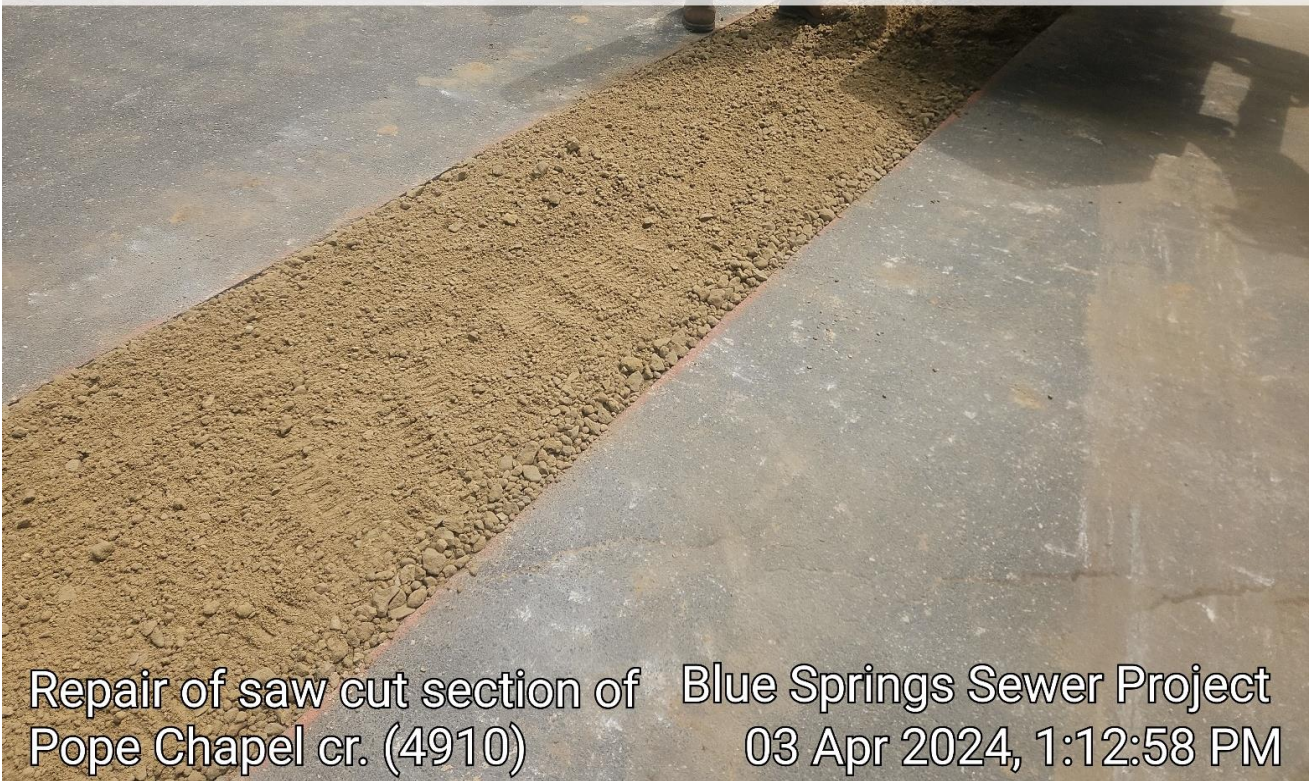
Repair of saw cut section of Pope Chapel cr. (4910) Blue Springs Sewer Project 03 Apr 2024, 1:12:58 PM

225° SW (T) • 30.782175, -85.186291 ±3 m ▲ 25m