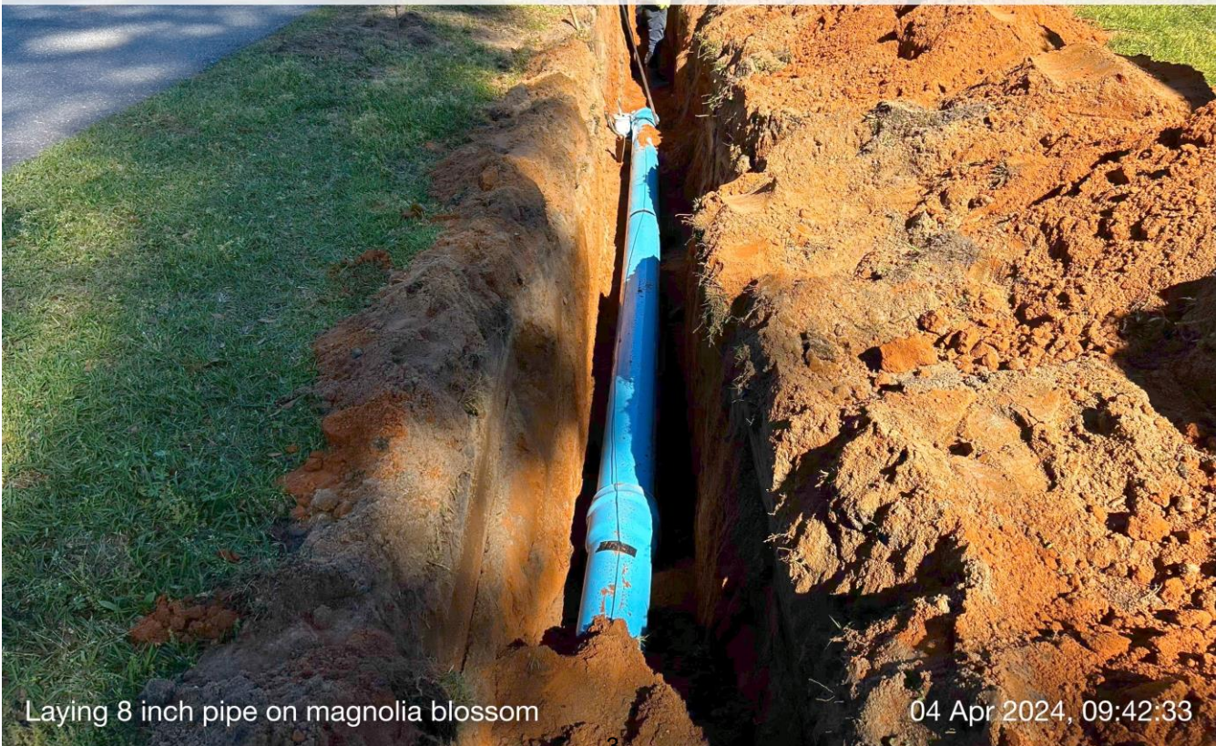
Laying 8 inch pipe on magnolia blossom

☉ 314°NW (T) ● 30°46'21"N, 85°9'49"W ±16ft ▲ 133ft