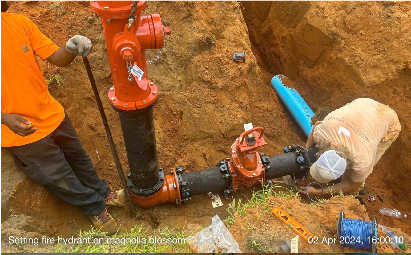
Setting fire hydrant on magnolia blossom

☉ 145°SE (T) ● 30°46'22"N, 85°9'51"W ±16ft ▲ 178ft