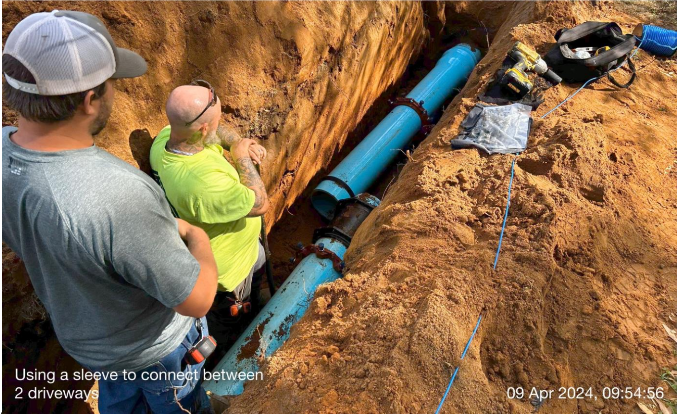
Using a sleeve to connect between 2 driveways

☀ 17°N (T) ● 30°46'29"N, 85°9'32"W ±29ft ▲ 161ft