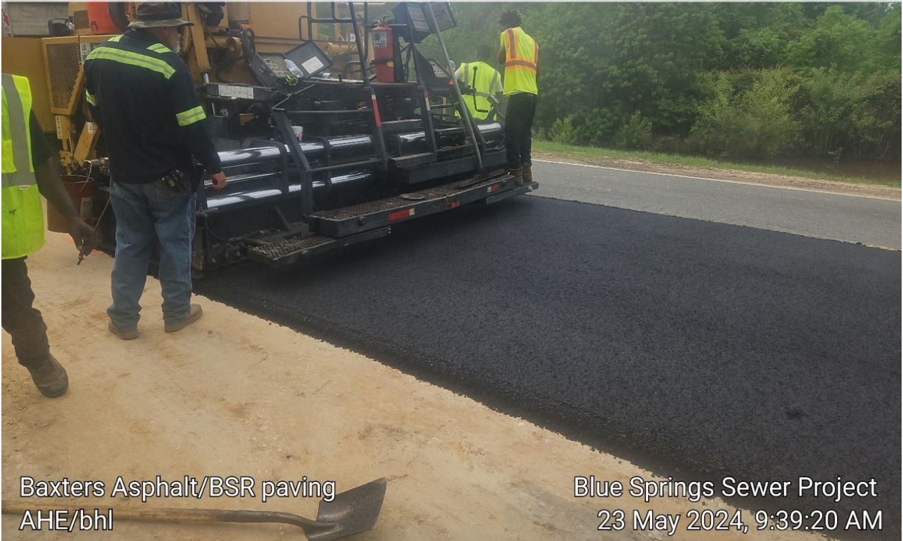
Baxters Asphalt/BSR paving AHE/bhl

☼ 131° SE (T) • 30.781127, -85.19031 ±3 m ▲ 24m