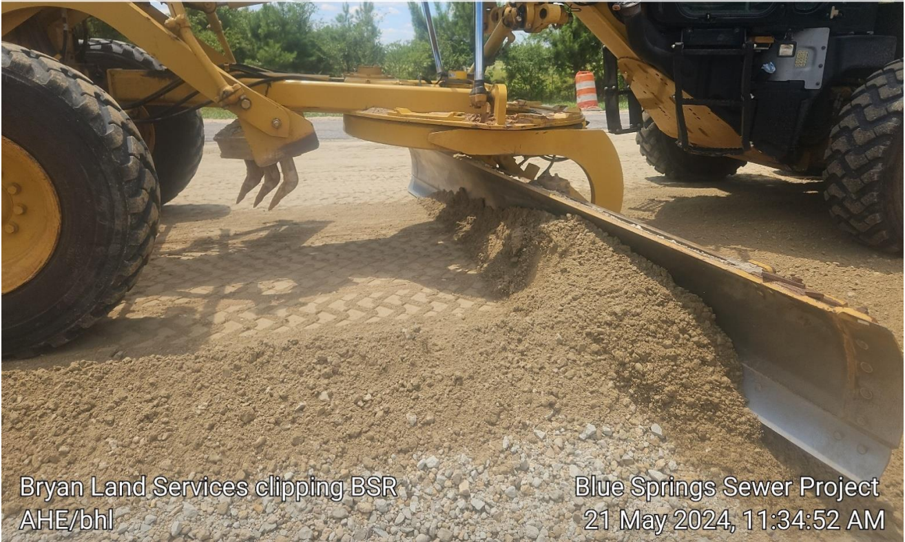
Bryan Land Services clipping BSR AHE/bhl

☼ 193° S (T) • 30.78162, -85.187689 ±3 m ▲ 24m