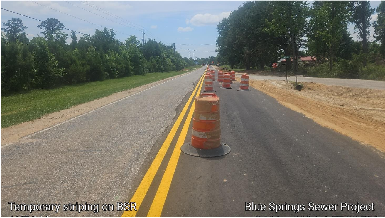
Temporary striping on BSR

☀ 301° W (T) ● 30.781588, -85.187561 ±3 m ▲ 24m