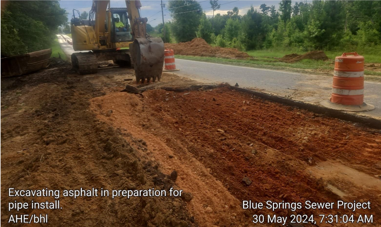
Excavating asphalt in preparation for pipe install. AHE/bhl

☉ 116° E (T) ● 30.783119, -85.178342 ±3 m ▲ 6m