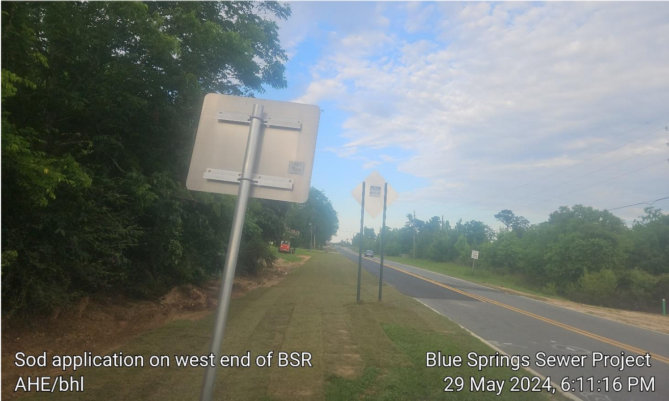
Sod application on west end of BSR AHE/bhl

☉ 49° NE (T) ● 30.781099, -85.190673 ±3 m ▲ 24m