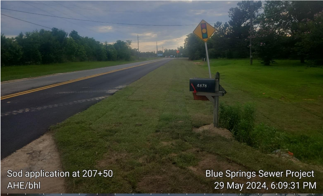
Sod application at 207+50 AHE/bhl

☉ 257° SW (T) ● 30.781315, -85.189375 ±3 m ▲ 24m