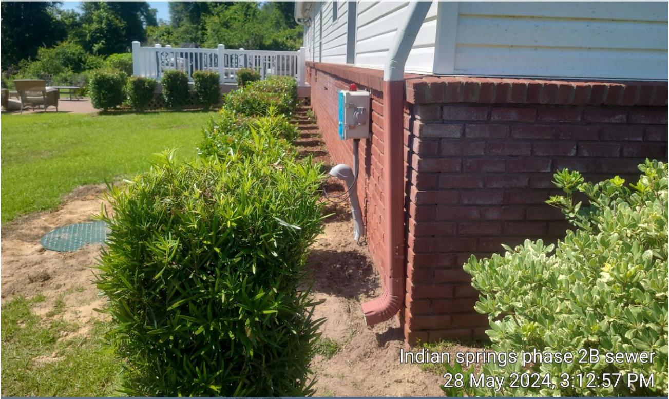
Indian springs phase 2B sewer 28 May 2024, 3:12:57 PM

13° N (T) • 30.77065, -85.166964 ±3 m ▲ 20m