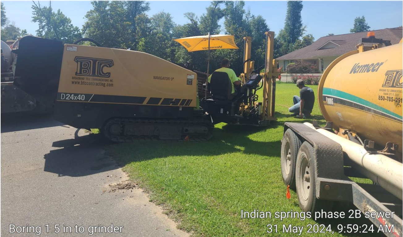
Boring 1.5 in to grinder

140° SE (T) • 30.772837, -85.168203 ±3 m ▲ 18m