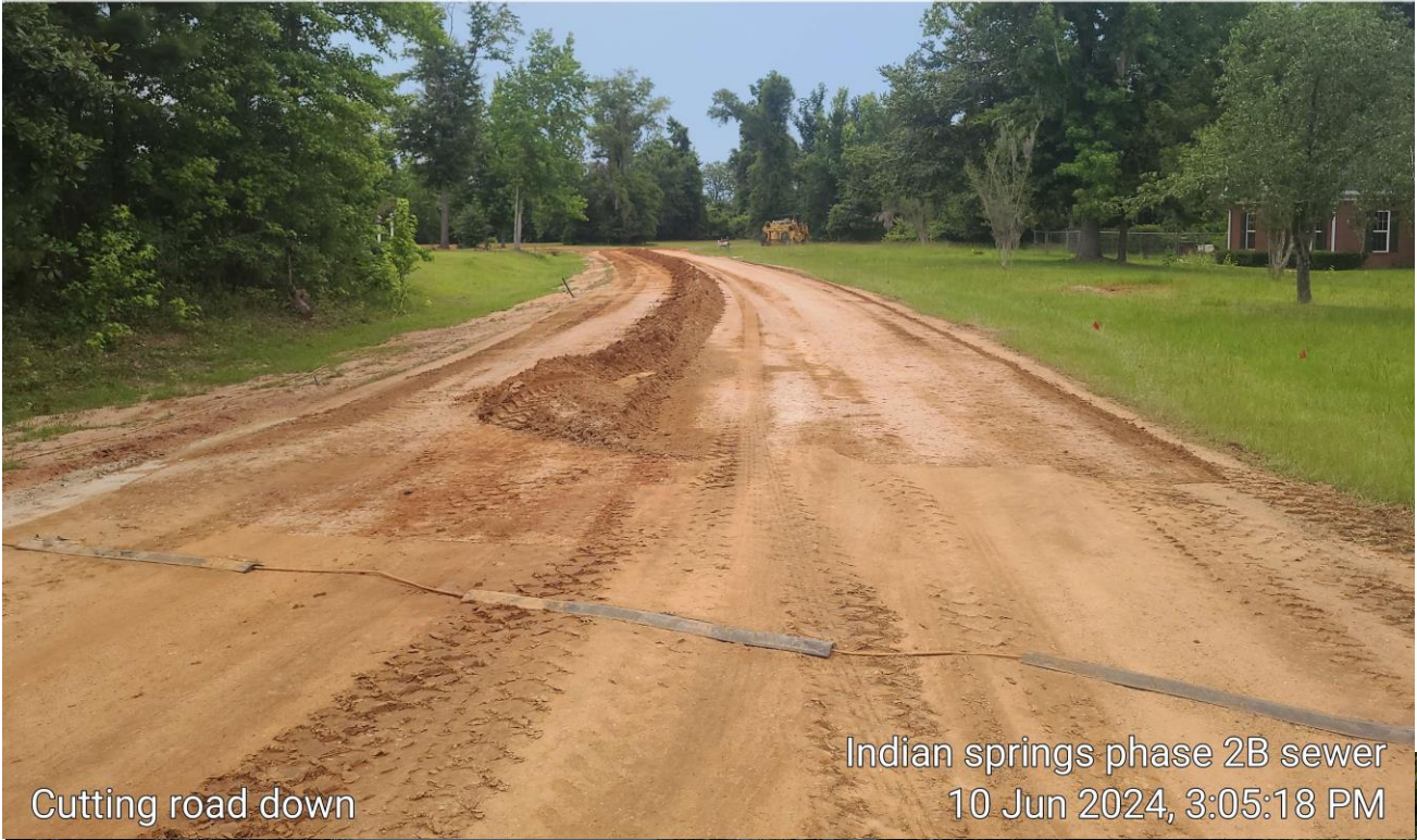
Cutting road down

☼ 303° W (T) ● 30.775142, -85.166559 ±3 m ▲ 20m