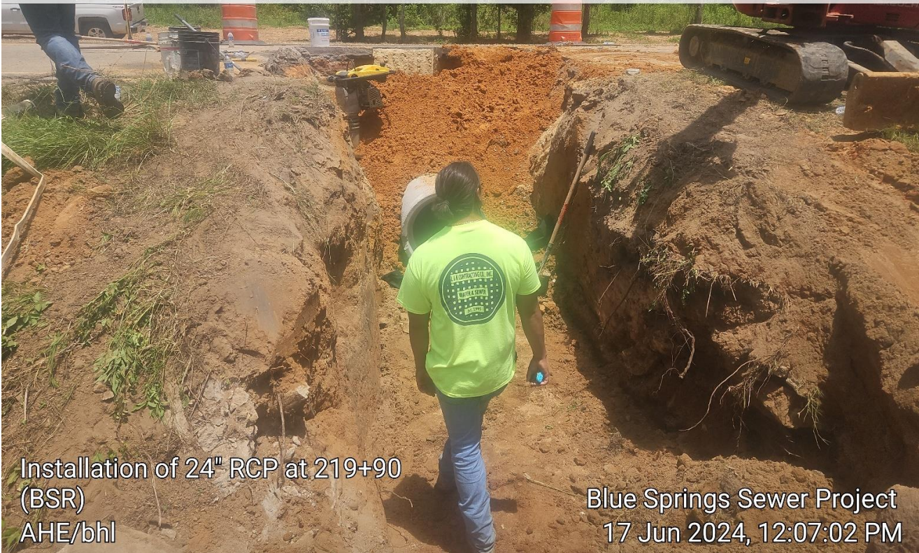
Installation of 24" RCP at 219+90 (BSR) AHE/bhl

☉ 18° N (T) ● 30.781838, -85.185423 ±4 m ▲ 24m