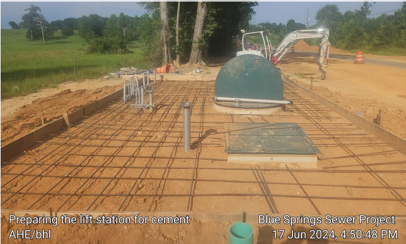
Preparing the lift station for cement AHE/bhl

☉ 84° E (T) • 30.783172, -85.178654 ±3 m ▲ 22m