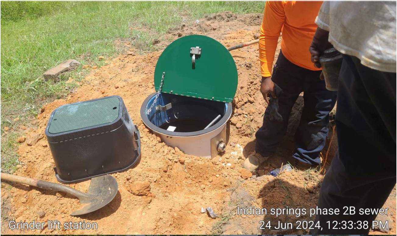
Grinder lift station

☀ 356° N (T) • 30.767562, -85.172703 ±9 m ▲ 16m