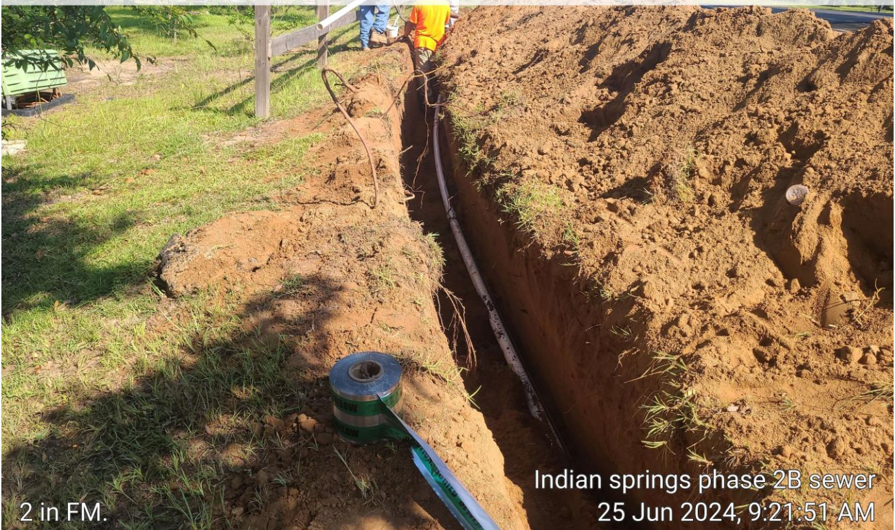
2 in FM.

☀ 312° NW (T) • 30.772853, -85.169477 ±6 m ▲ 15m