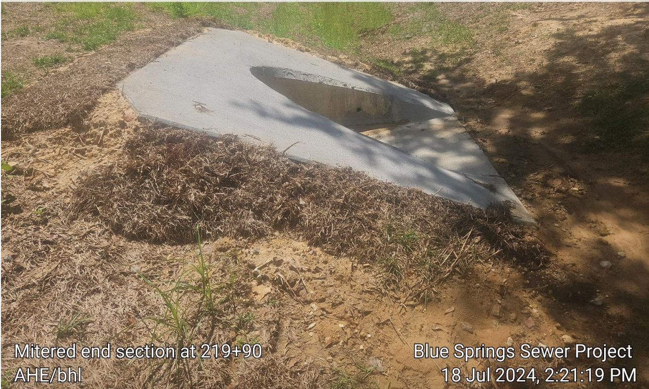
Mitered end section at 219+90 AHE/bhl

☉ 233° SW (T) • 30.782017, -85.185402 ±6 m ▲ 24m