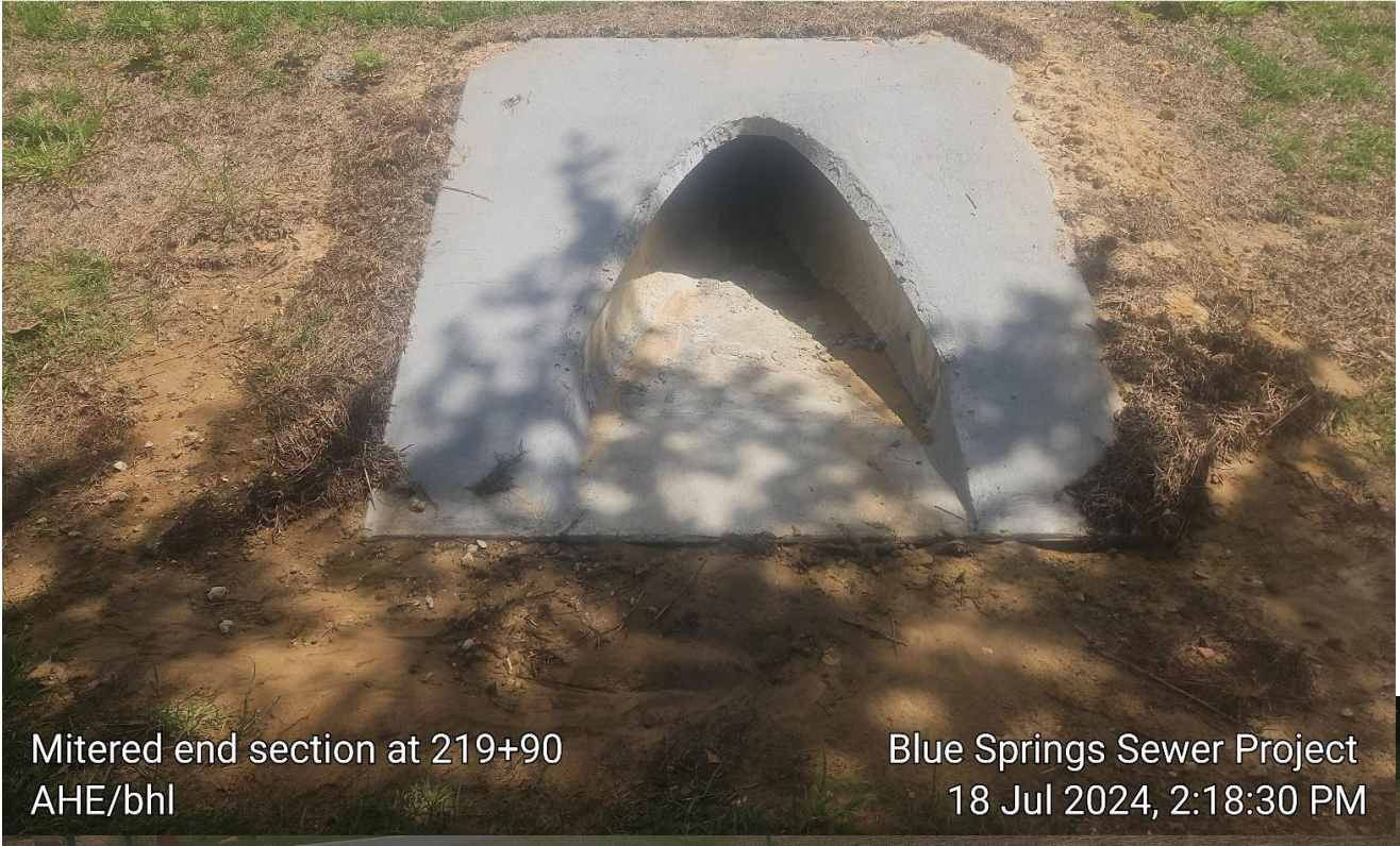
Mitered end section at 219+90 AHE/bhl

☉ 169° S (T) • 30.782049, -85.185431 ±3 m ▲ 24m