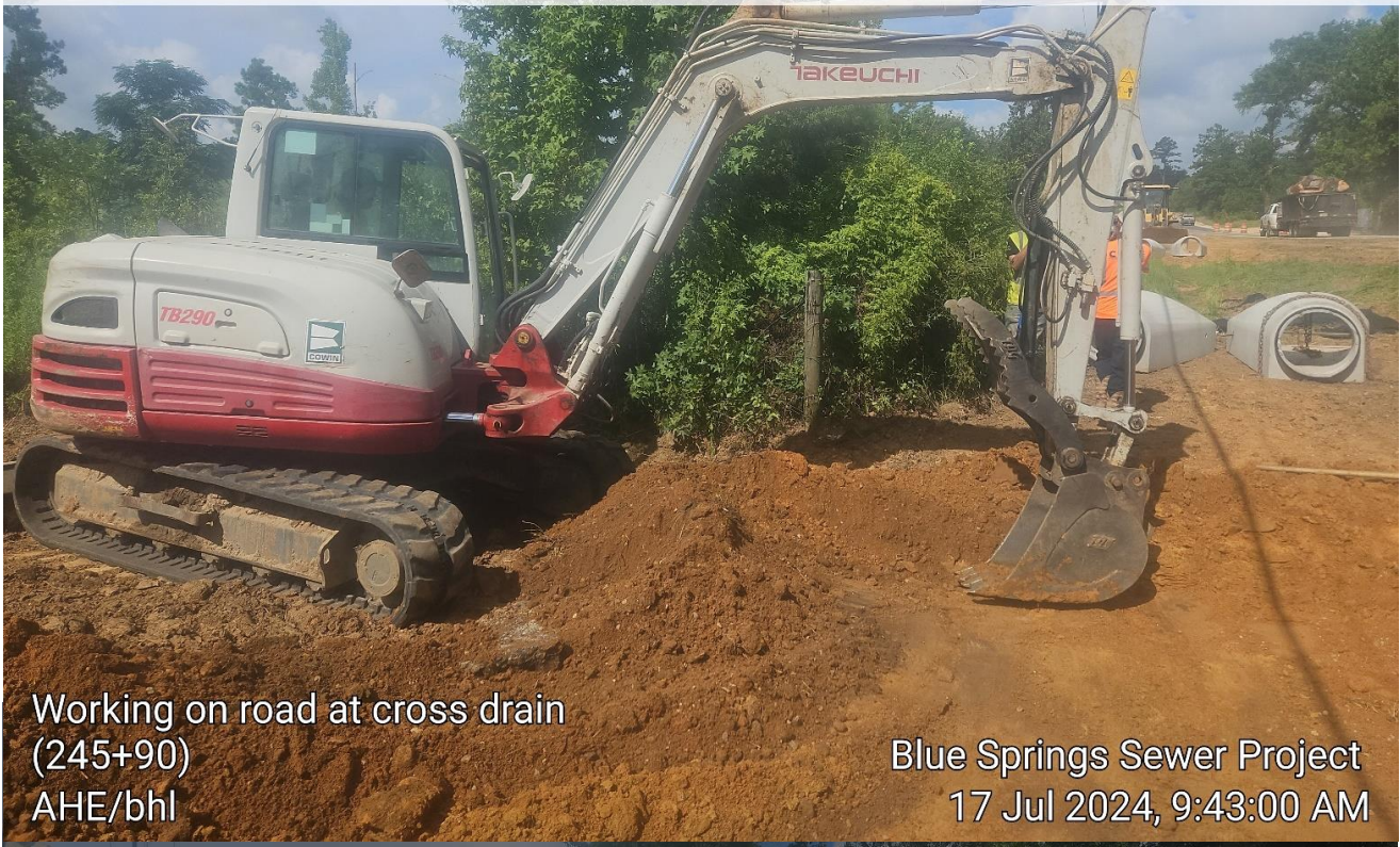
Working on road at cross drain (245+90) AHE/bhl

☉ 227° SW (T) • 30.783138, -85.177219 ±3 m ▲ 13m