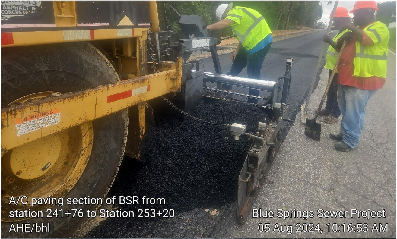
A/C paving section of BSR from station 241+76 to Station 253+20 AHE/bhl

☉ 54° NE (T) • 30.783389, -85.176551 ±3 m ▲ 12m