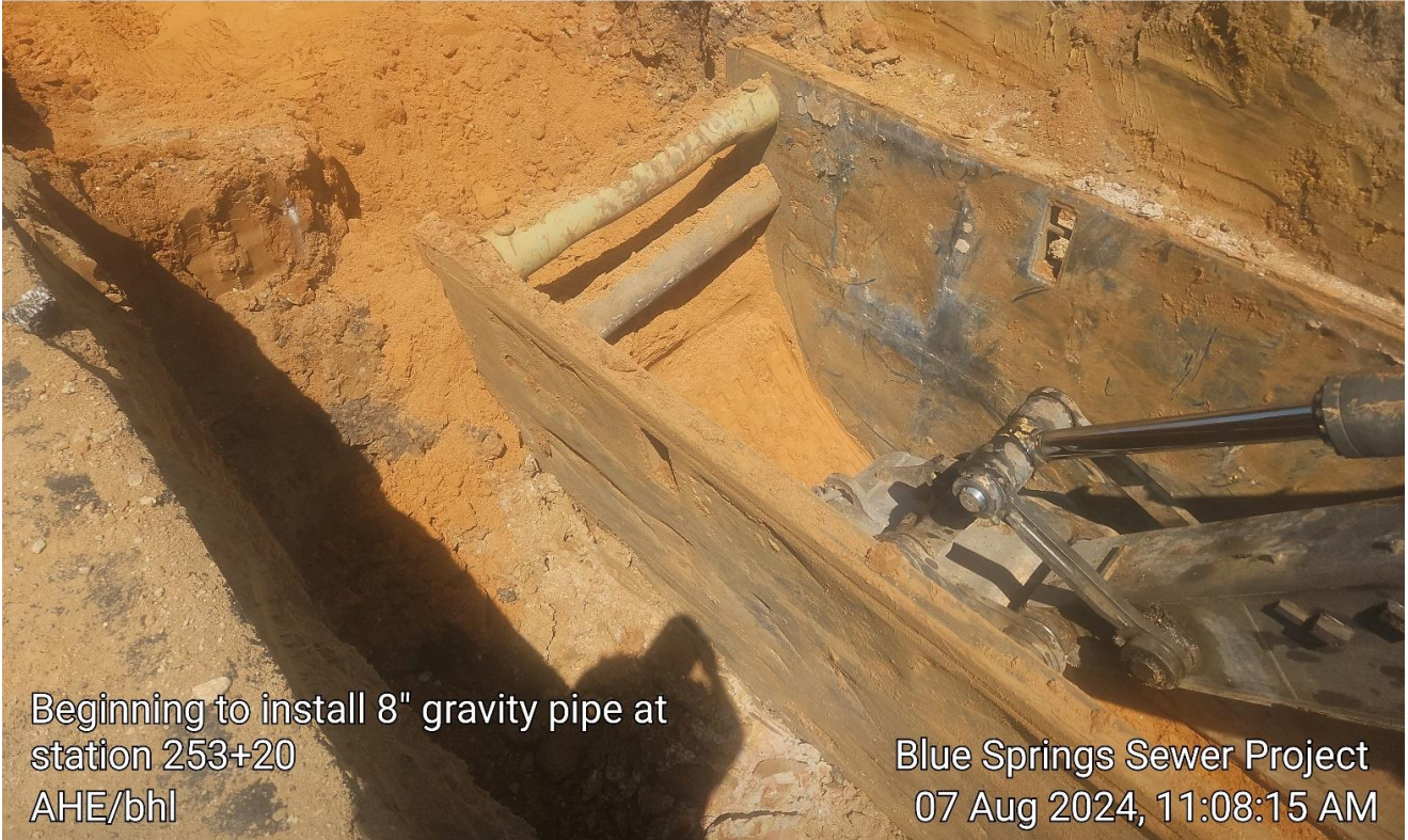
Beginning to install 8" gravity pipe at station 253+20 AHE/bhl

☉ 284° W (T) ● 30.782805, -85.174971 ±62 m ▲ 19m