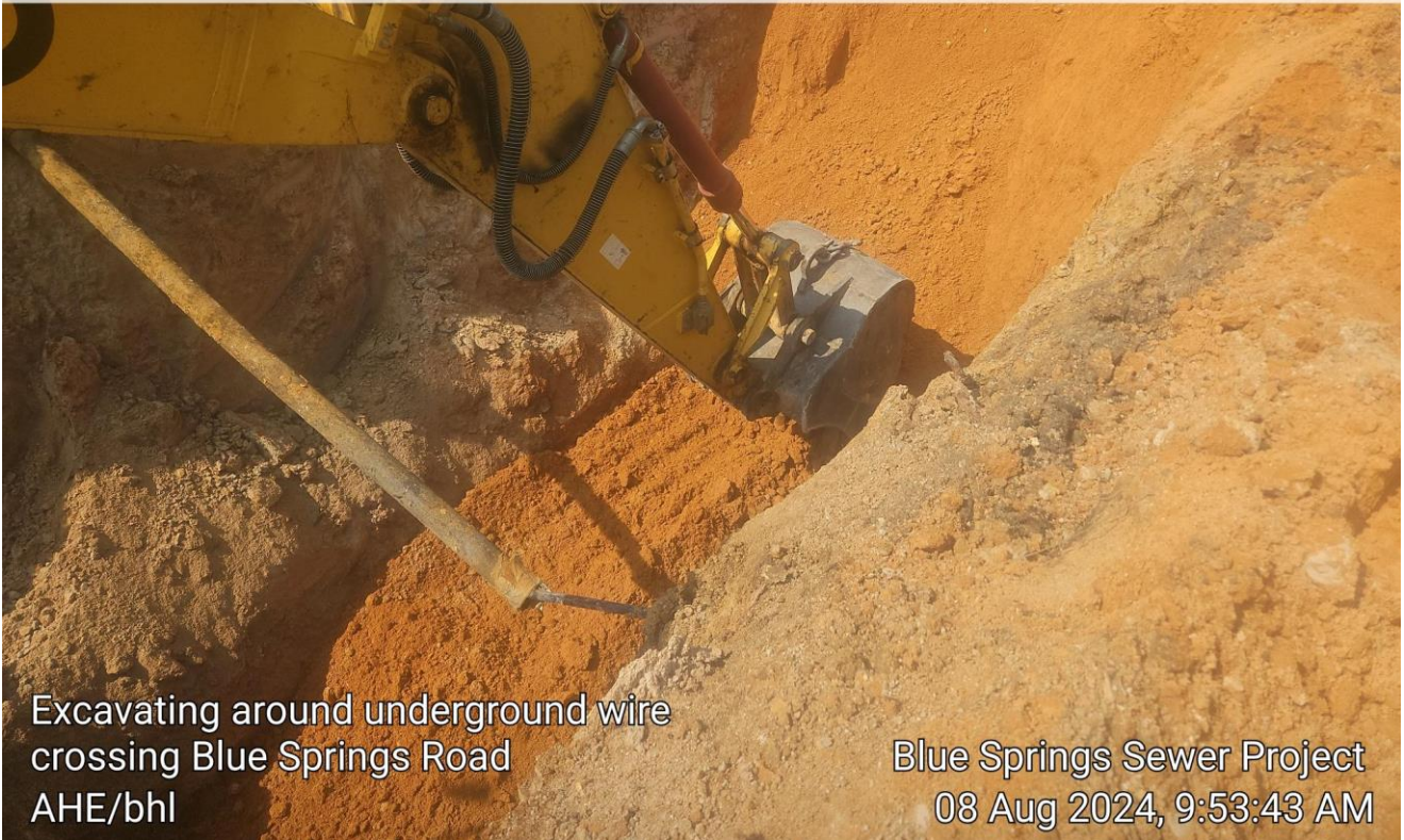
Excavating around underground wire crossing Blue Springs Road AHE/bhl

☉ 187° S (T) • 30.783765, -85.174704 ±3 m ▲ 17m