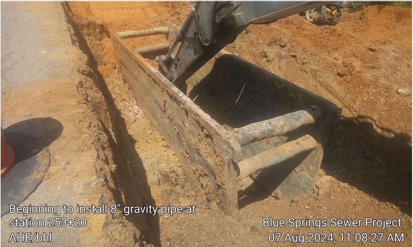
Beginning to install 8" gravity pipe at station 253+20 AHE/bhl

☉ 283° W (T) ● 30.783743, -85.174756 ±3 m ▲ 17m