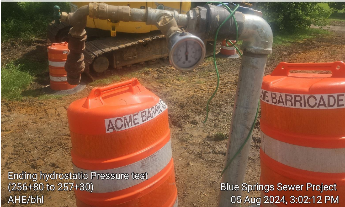
Ending hydrostatic Pressure test (256+80 to 257+30) AHE/bhl

☉ 195° S (T) ● 30.783994, -85.173684 ±4 m ▲ 21m