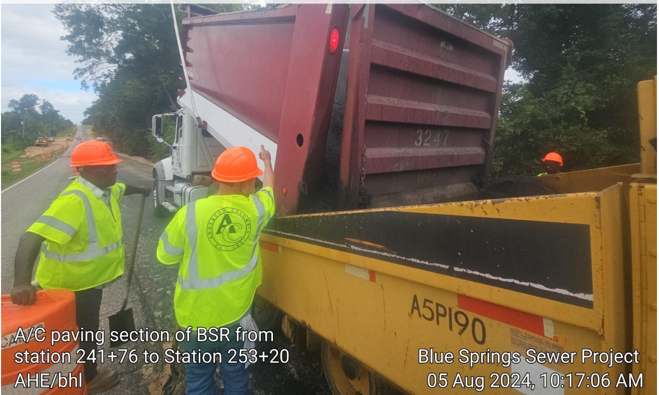
A/C paving section of BSR from station 241+76 to Station 253+20 AHE/bhl

☉ 300° W (T) • 30.78339, -85.17655 ±3 m ▲ 10m