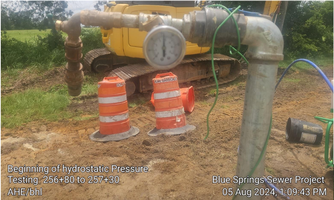
Beginning of hydrostatic Pressure Testing 256+80 to 257+30 AHE/bhl

☉ 153° SE (T) ● 30.784014, -85.173671 ±4 m ▲ 15m