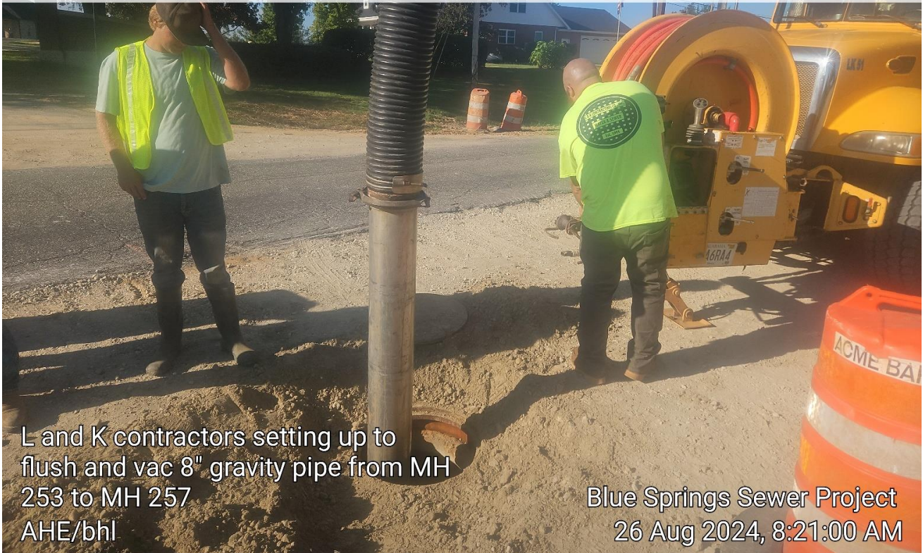
L and K contractors setting up to flush and vac 8" gravity pipe from MH 253 to MH 257 AHE/bhl

☉ 194° S (T) • 30.783687, -85.174913 ±19ft ▲ 55ft