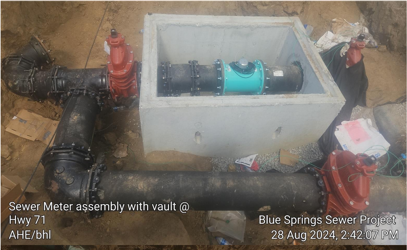
Sewer Meter assembly with vault @ Hwy 71 AHE/bhl

☉ 93° E (T) ● 30.770215, -85.202374 ±9ft ▲ 26ft