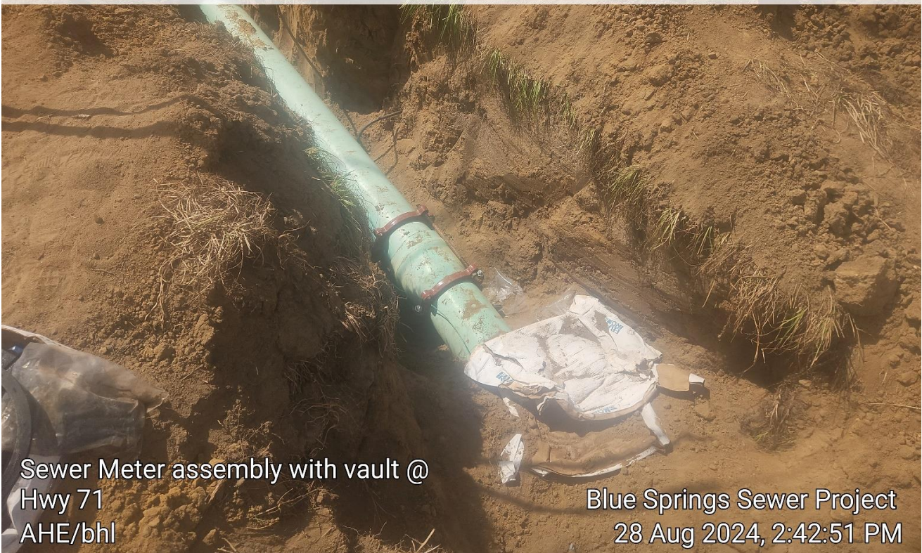
Sewer Meter assembly with vault @ Hwy 71 AHE/bhl

☉ 297° W (T) ● 30.770156, -85.202372 ±23ft ▲ 26ft