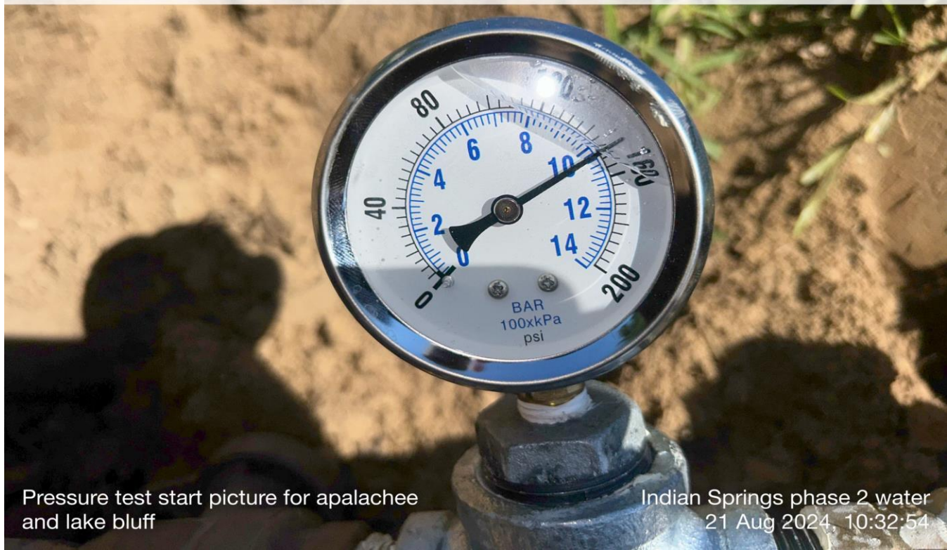
Pressure test start picture for apalachee and lake bluff

☉ 310°NW (T) ● 30°46'8"N, 85°9'55"W ±13ft ▲ 162ft