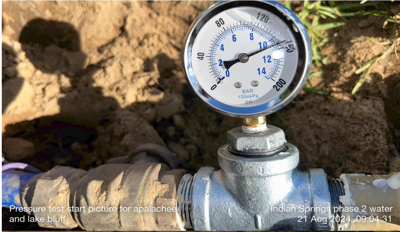
Pressure test start picture for apalachee and lake bluff

☉ 333°NW (T) ● 30°46'8"N, 85°9'55"W ±13ft ▲ 191ft