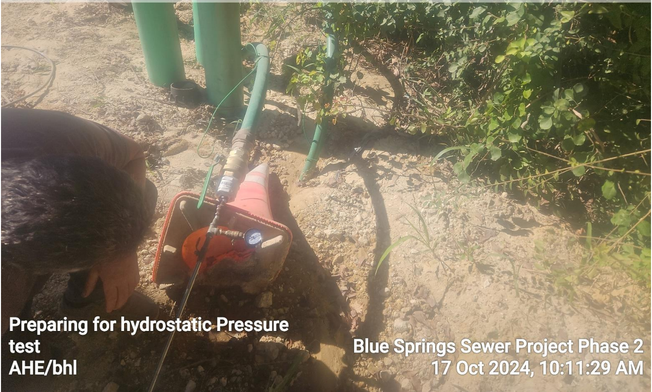
Preparing for hydrostatic Pressure test AHE/bhl

☉ 185°S (T) • 30.779436, -85.18727 ±9ft ▲ 88ft