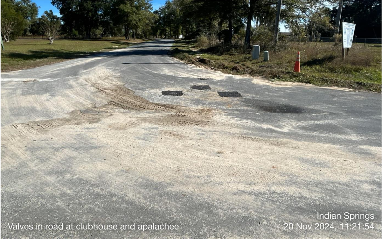
Valves in road at clubhouse and apalachee

☀ 117°SE (T) ● 30°46'7"N, 85°9'55"W ±13ft ▲ 160ft