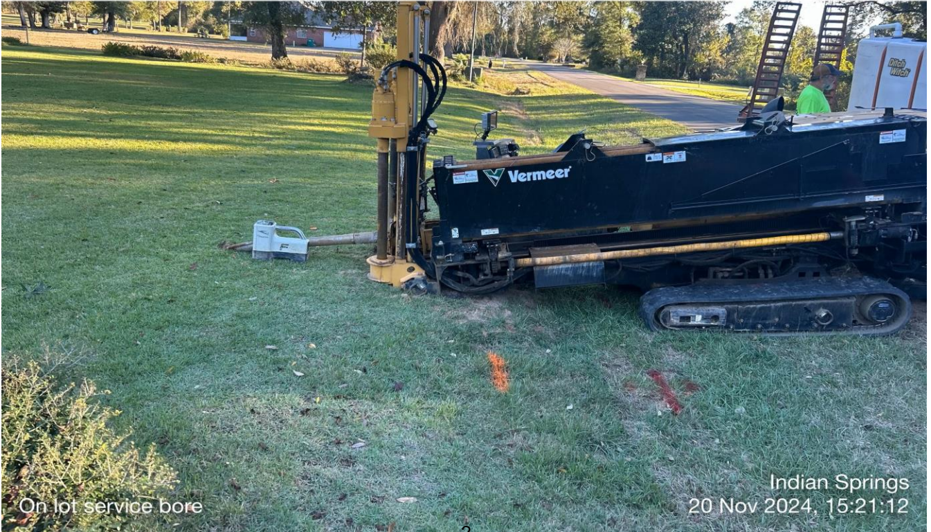
On lot service bore

☀ 171°S (T) ● 30°46'19"N, 85°9'59"W ±45ft ▲ 186ft