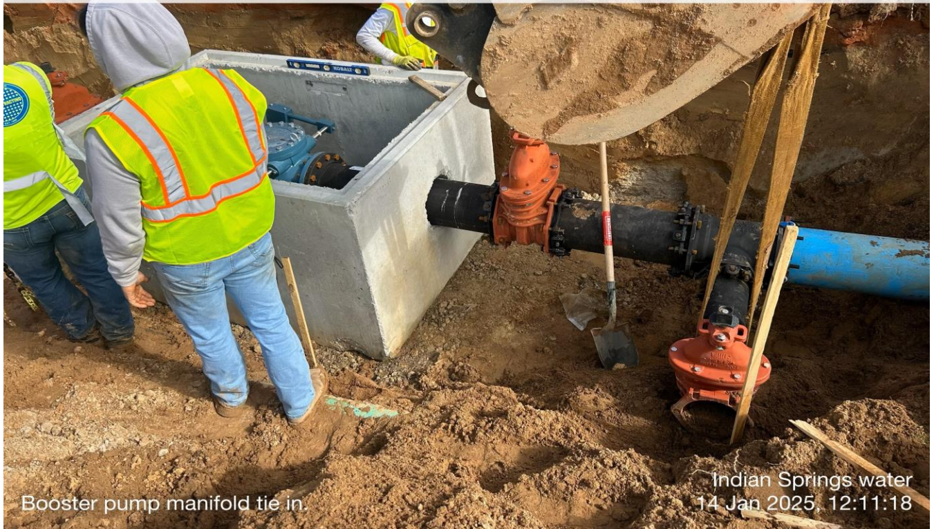
Booster pump manifold tie in.

☀ 71°E (T) ☉ 30°44'47"N, 85°10'19"W ±19ft ▲ 136ft