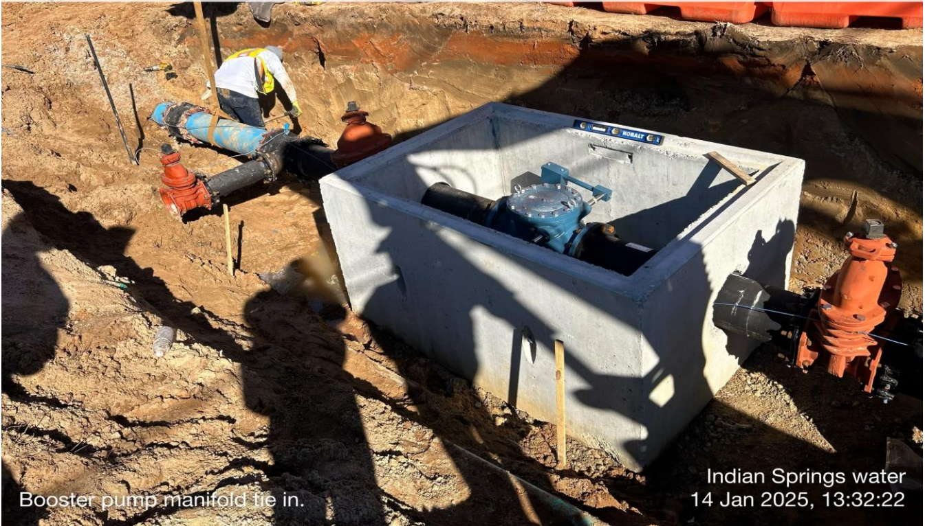
Booster pump manifold tie in.

☀ 45°NE (T) ☉ 30°44'47"N, 85°10'20"W ±39ft ▲ 124ft