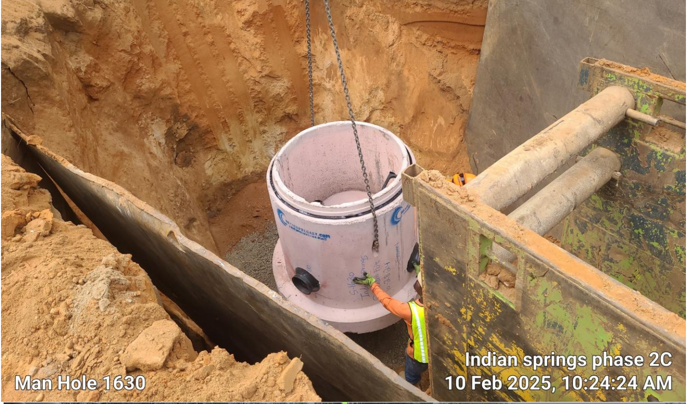
Man Hole 1630

☉ 235°SW (T) • 30.776394, -85.155992 ±8m ▲ 15m