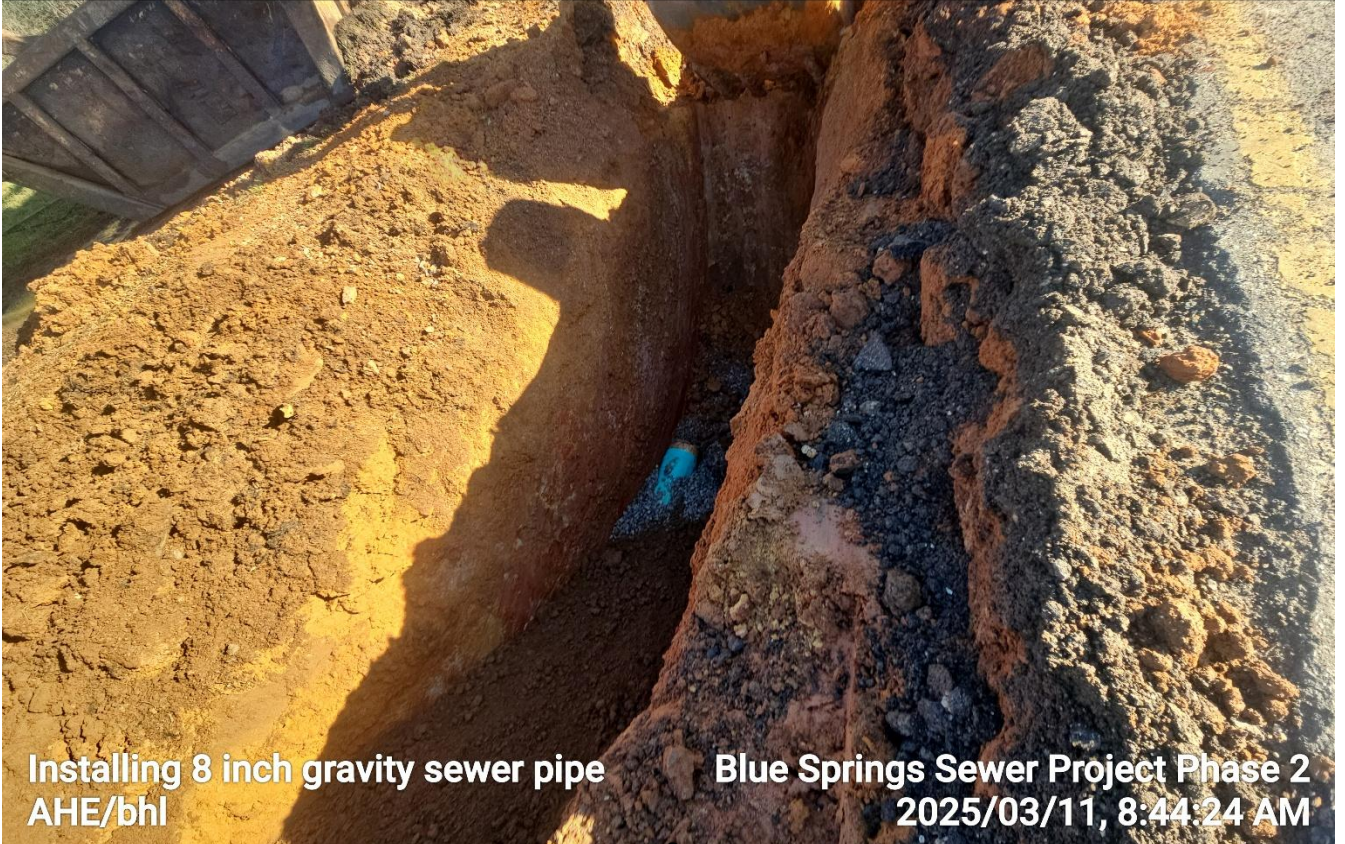
Installing 8 inch gravity sewer pipe AHE/bhl