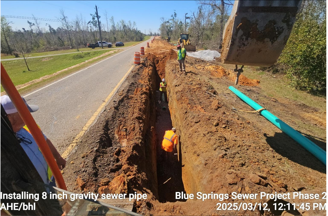
Installing 8 inch gravity sewer pipe AHE/bhl