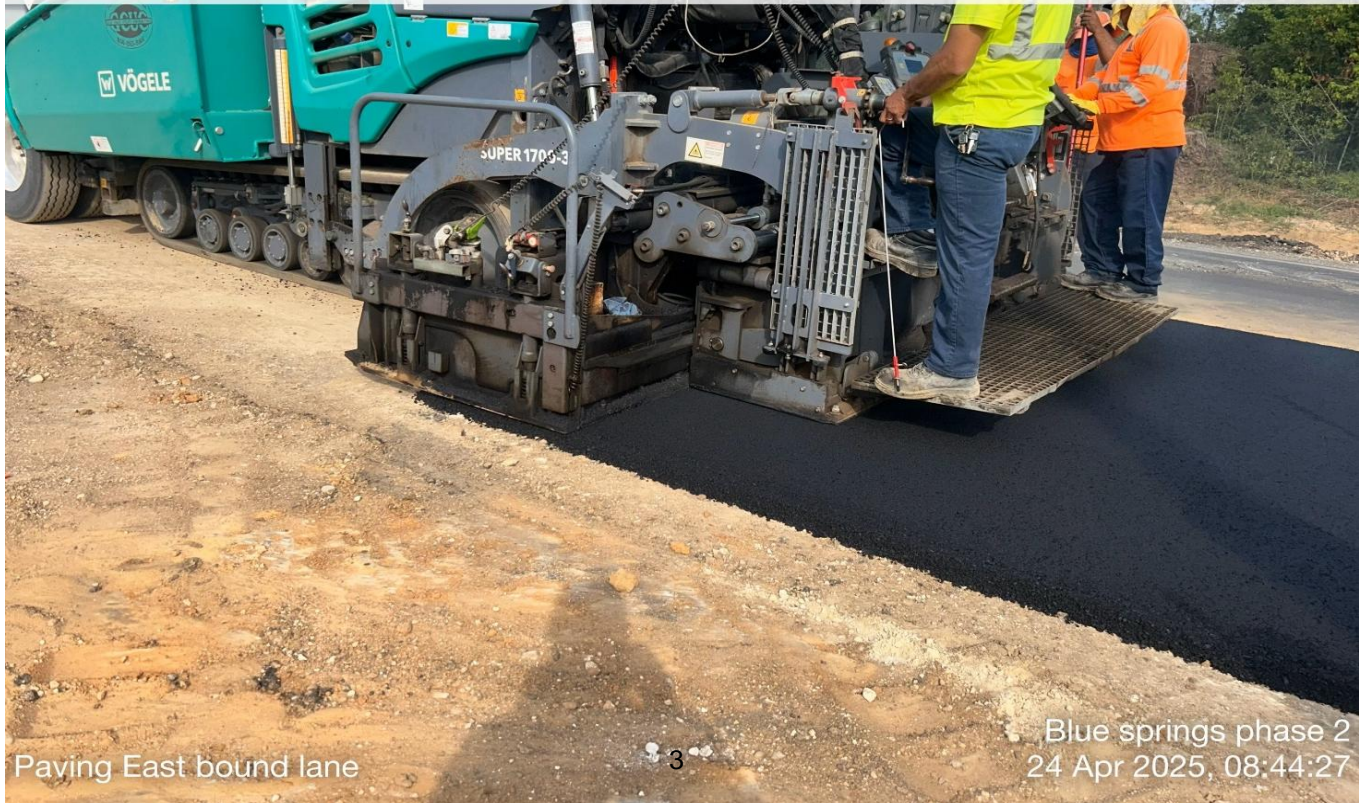
Paving East bound lane

☀ 276°W (T) ☉ 30°47'15"N, 85°10'4"W ±52ft ▲ 165ft