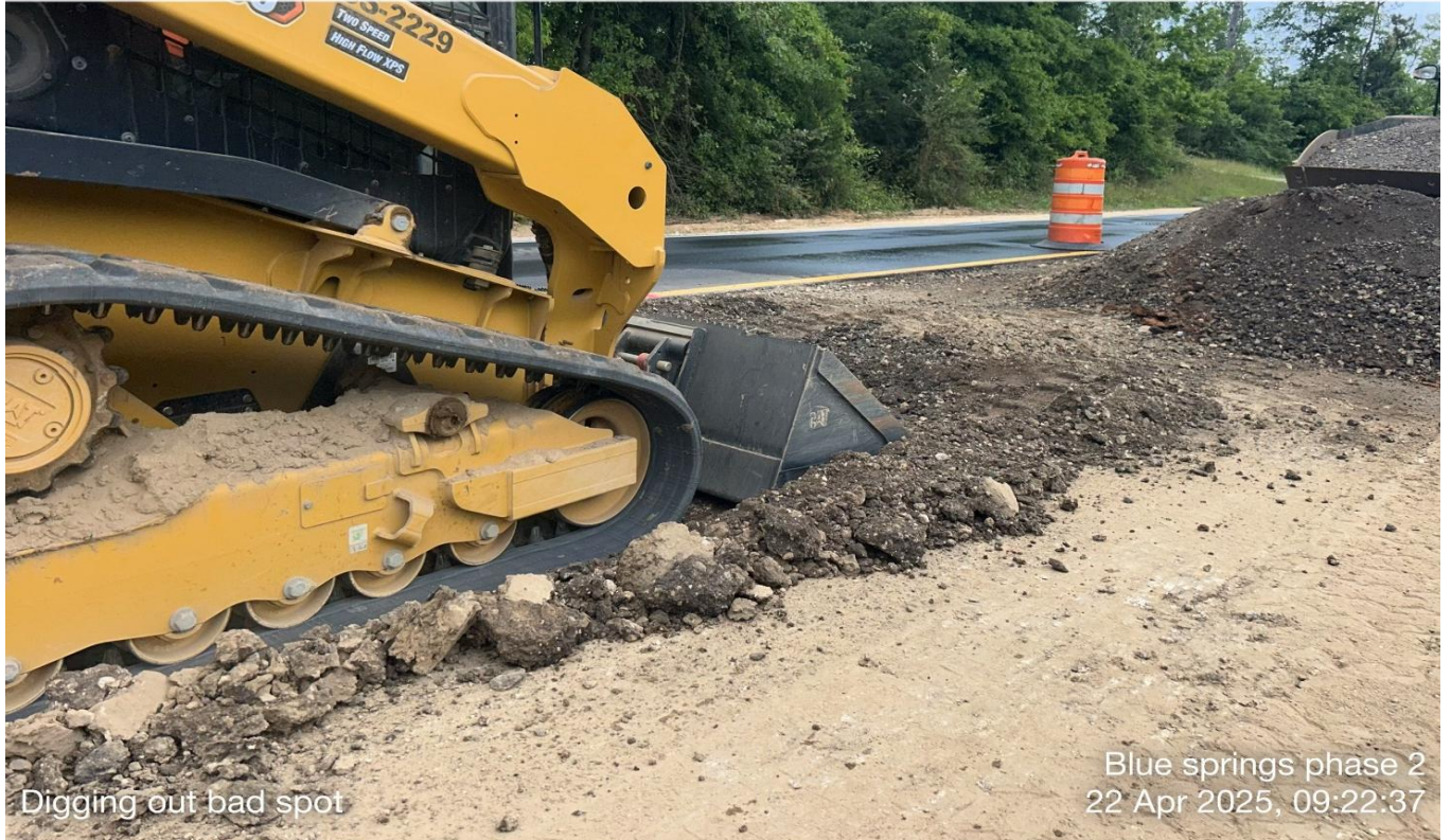
Digging out bad spot

☀ 26°NE (T) ☉ 30°47'10"N, 85°10'11"W ±9ft ▲ 162ft