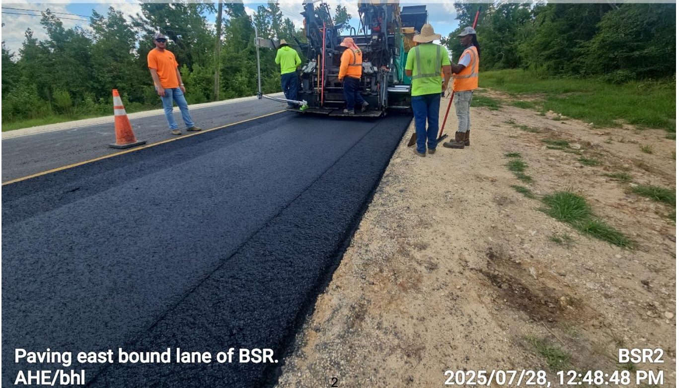
Paving east bound lane of BSR. AHE/bhl

☉ 172°S (T) • 30.787005, -85.169181 ±9ft ▲ 85ft