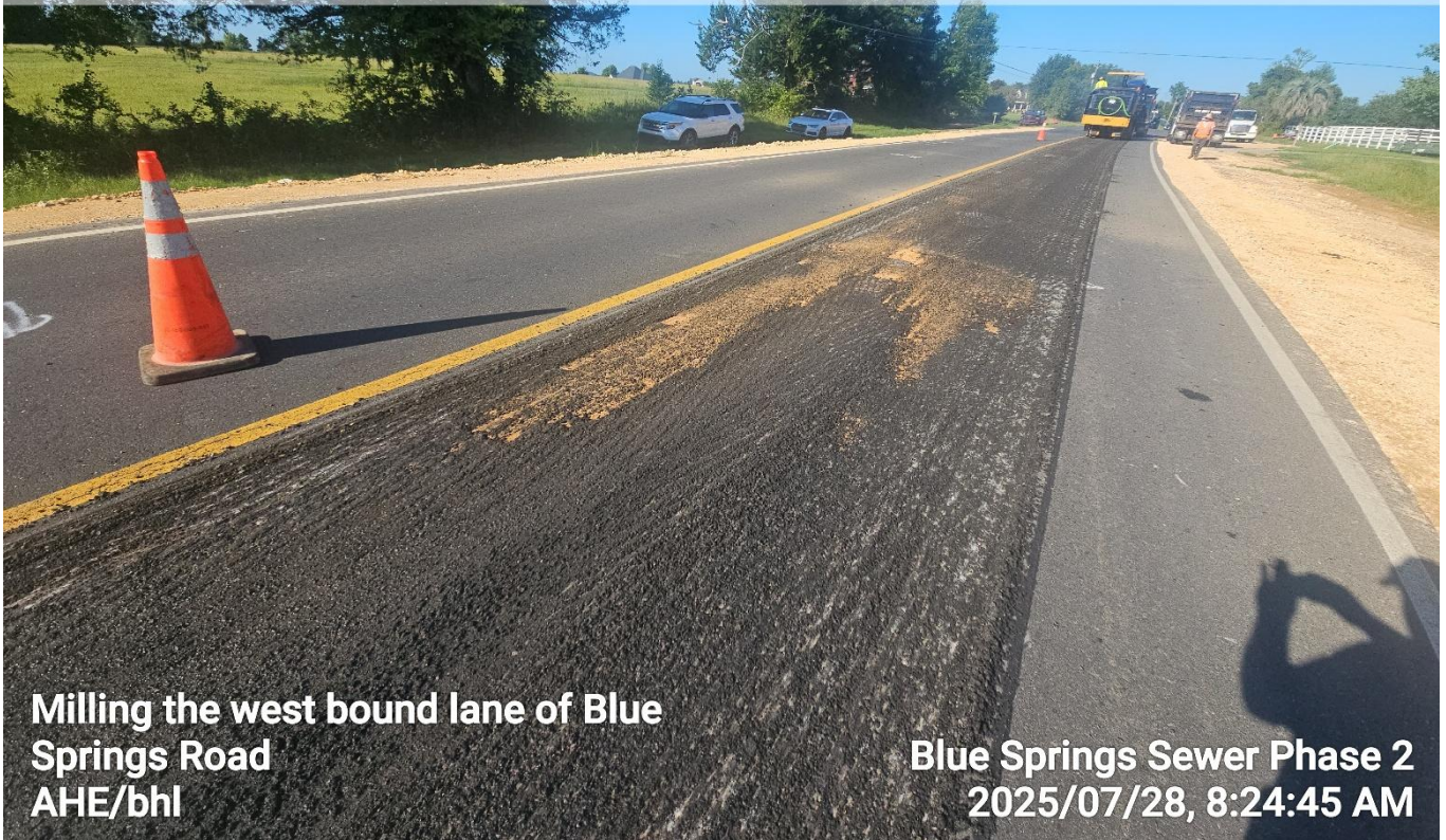
Milling the west bound lane of Blue Springs Road AHE/bhl

☉ 187°S (T) • 30.784202, -85.173286 ±9ft ▲ 65ft