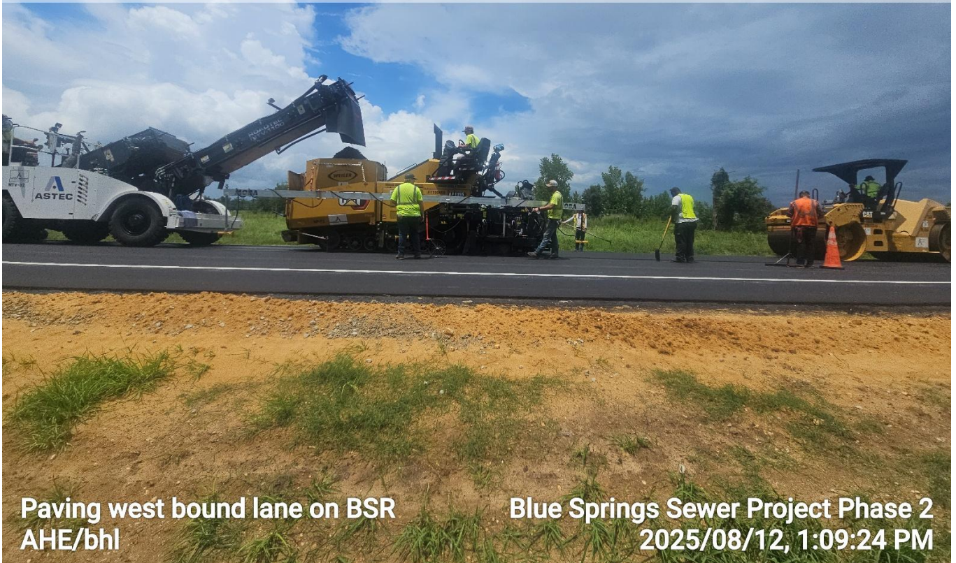
Paving west bound lane on BSR AHE/bhl

⊙ 346°NW (T) ⊙ 30.784491, -85.172421 ±9ft ▲ 59ft