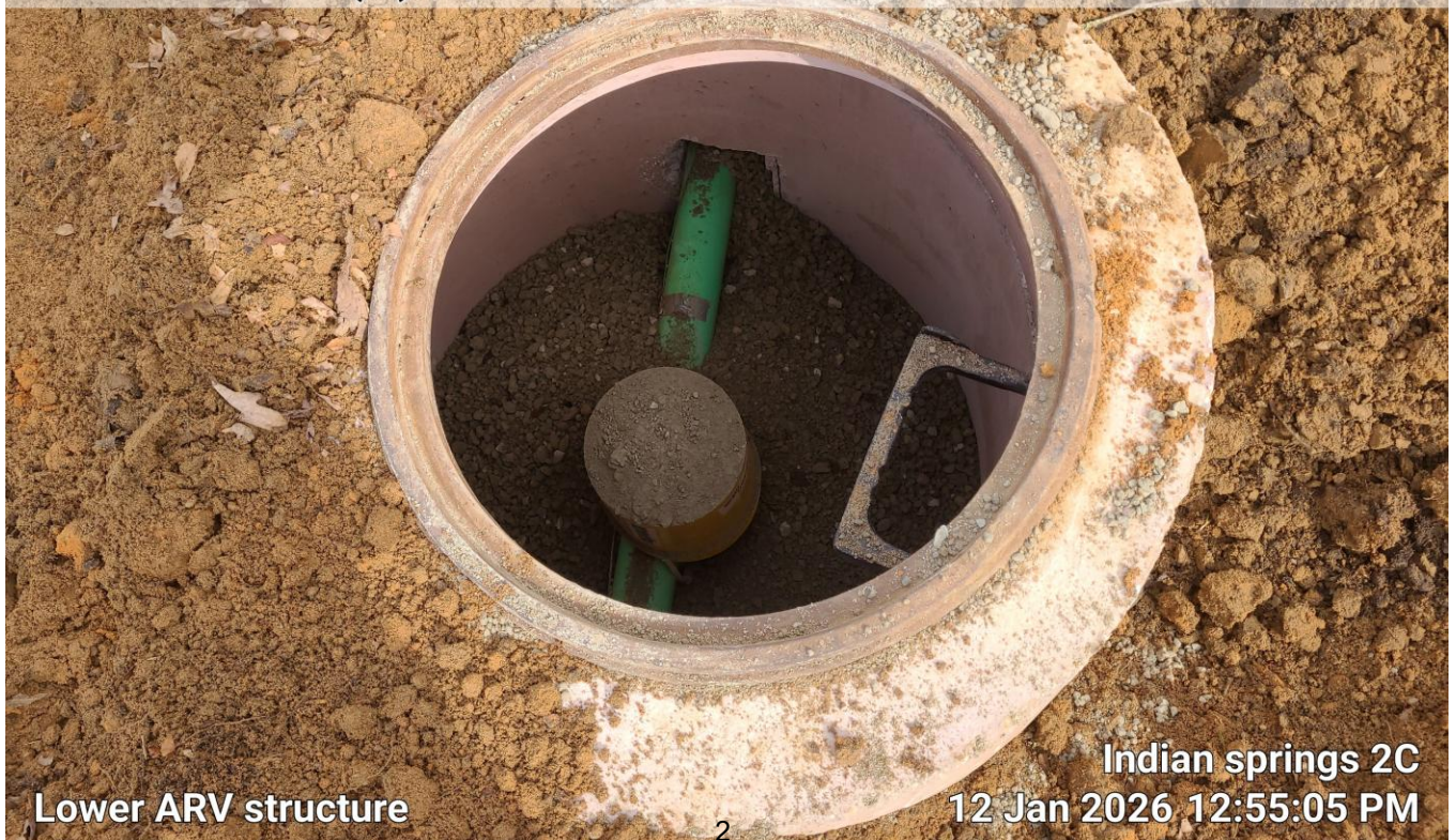
Lower ARV structure

☉ 46°NE (T) • 30.772608, -85.16219 ±3m ▲ 23m