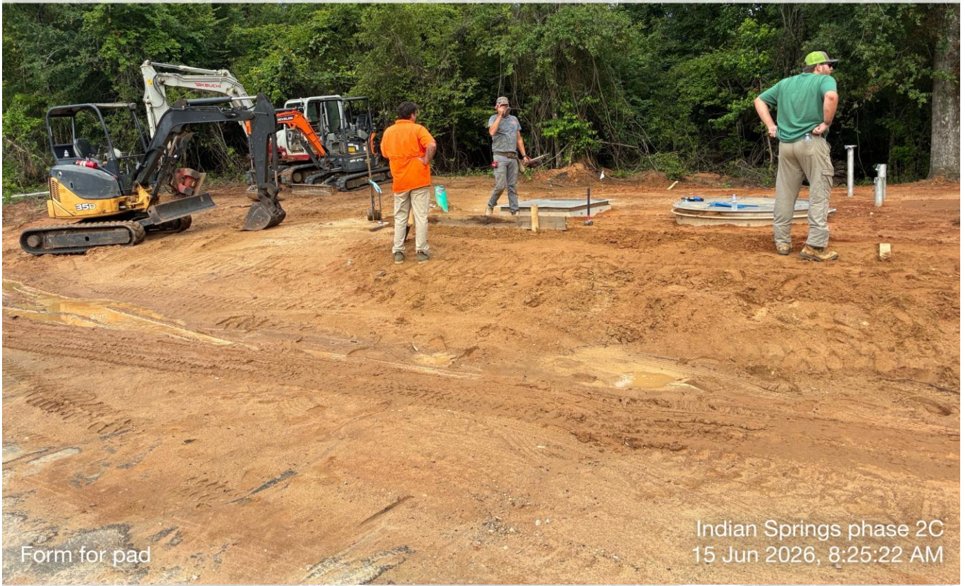
Form for pad

☀ 241°SW (T) ☉ 30°46'45"N, 85°9'19"W ±2m ▲ 46m (MSL)