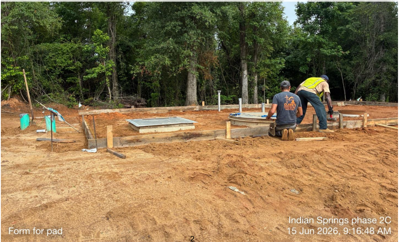
Form for pad

Indian Springs phase 2C 15 Jun 2026, 8:25:22 AM